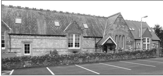
Newchurch School 2020 (before the fences)

Our primary school building, here in School Lane, is the location of current education for the many pupils who attend, not only from Newchurch Parish, also further afield. The Victorian building has been renovated and extended over the years, including the main hall, originally Community Hall added from NPS&CA Garlic Festival funds. In the grounds of the school, there was also once a nursery for pre-school children, a facility particularly popular with working parents. Our attractive school building has not always been where local young people learned their Reading, 'Riting and 'Rithmetic!